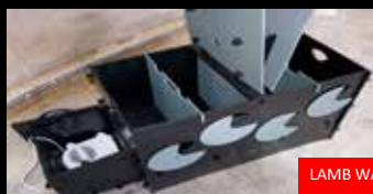
LAMB WARMING BOX