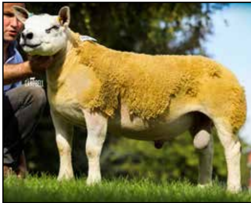
ALLANFAULD FLAMING STAR