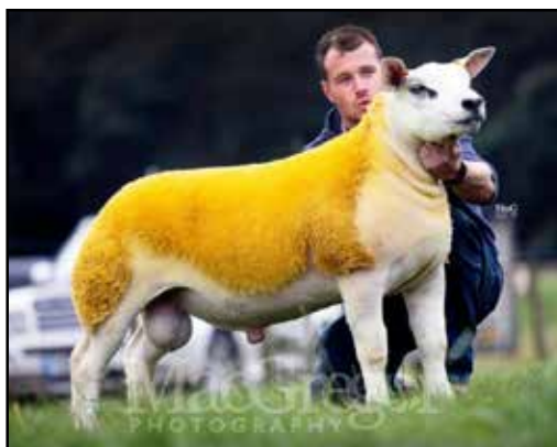
HAYMOUNT DALLAS COWBOY

Dam: AWJ1801419 by MILNBANK AWESOME LYM1702542(E)