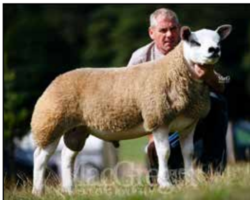
HOLYLEE EWE DANCER - 12000GNS

Dam: PDV1914105(E1) by AULHOUSEBURN BILLY THE KID BYZ1820642(E1)