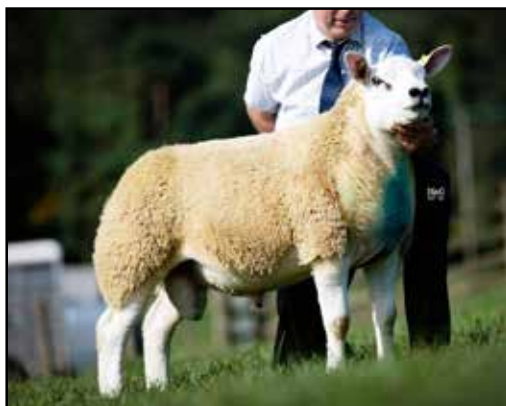
CLADDAGH DYNAMITE 5500GNS

Dam: UVP1803316(E2) by STRATHBOGIE YA BELTER IJS1600653(E)