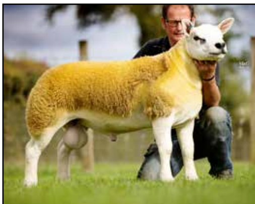
KNAP FRED FLINTSTONE