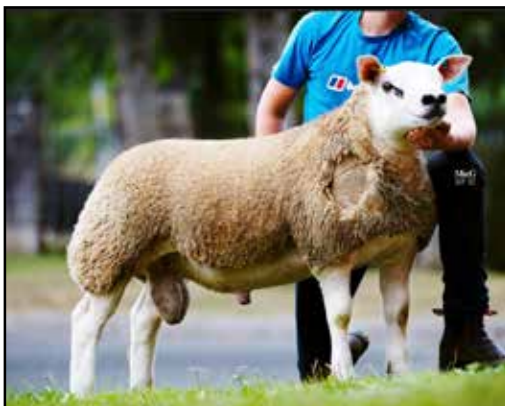
PENIEL FIRST CLASS

Jointly purchased and won Overall Champion at Ruthin 2022