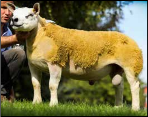
ALLANFAULD FLAMING STAR