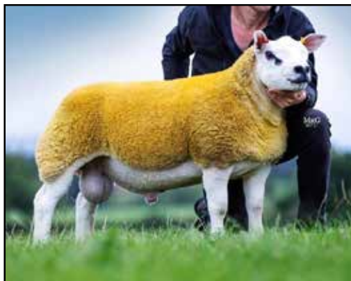
HAYMOUNT EARTH, WIND AND FIRE

Dam: AWJ1701318(2) by CLINTERTY YUGA KHAN BBY1601056(E)