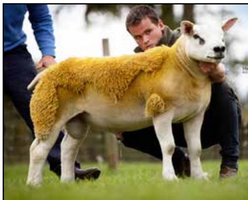
STUMP CROSS FOREMAN

Dam: CXP2017903(E1) by PLASUCHA ABERFELDY BFE1707080(E)