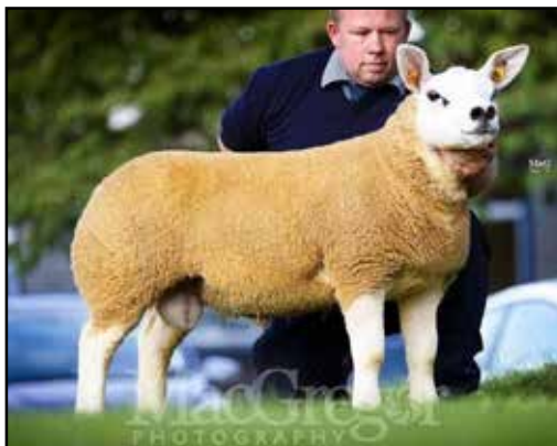
PROCTERS CHUMBA WUMBA

Dam: PDF1701660(E) by TEIGLUM YOUNGGUN CFT1604569(E)