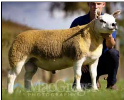
GARNGOUR FIRST CLASS