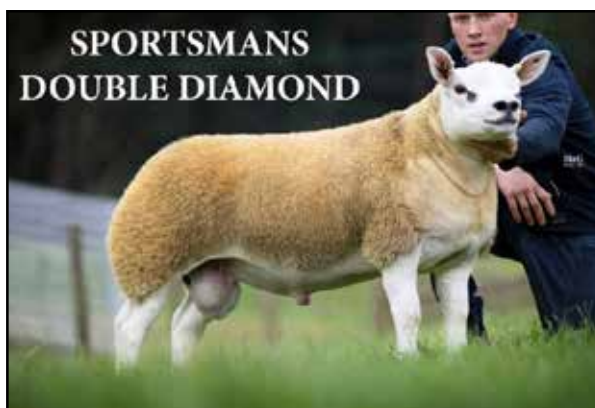
SPORTSMANS DOUBLE DIAMOND

Dam: CXP2017903(E1) by PLASUCHA BIG GUN BFE1808110(E1)