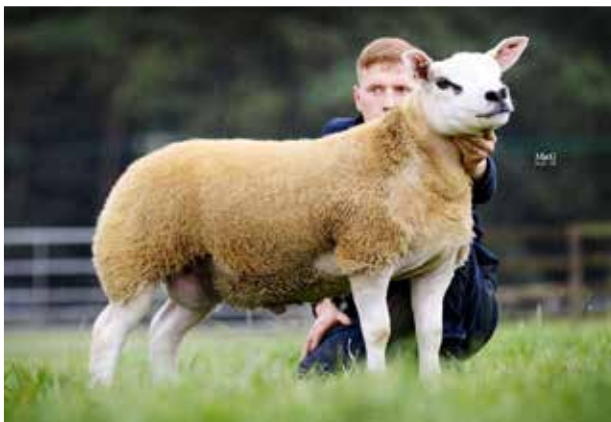
SPORTSMANS DIRTY HARRY

Dam: BYZ1820801(E2) by SPORTSMANS A STAR BGS1702642(E)