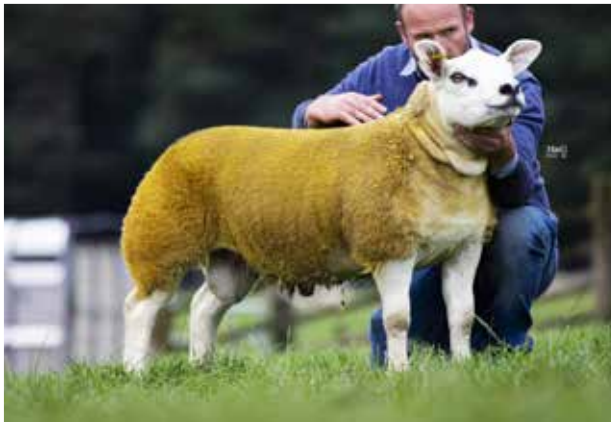
TEIGLUM DANCING BRAVE

Dam: CFT1705056(E) by KNOCK YARDSMAN HAK1601070(E)