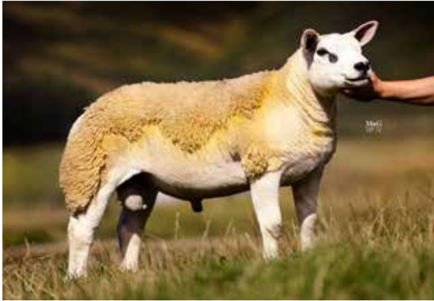
STUMP CROSS FOREMAN

Dam: CXP2017903(E1) by PLASUCHA ABERFELDY BFE1707080(E)