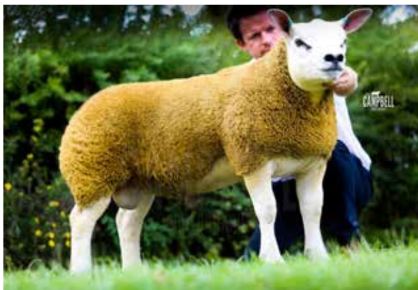
AULDHOUSEBURN FANCY PANTS