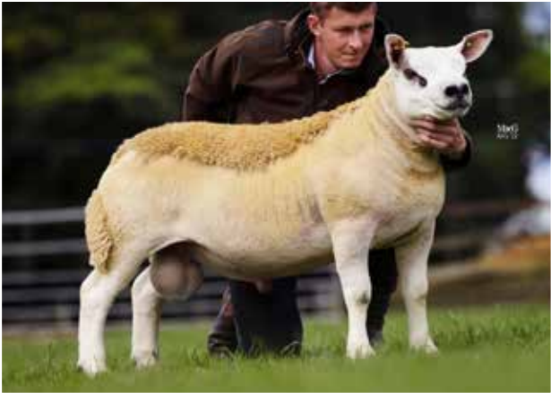
HADDO FEARLESS II