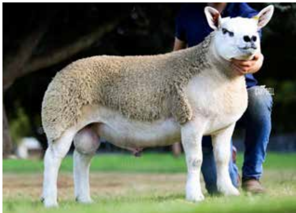
MILNBANK FREDDIE II

Dam: LYM1903504(E2) by COWAL BUCKING BRONCO CKC1809950(E1)