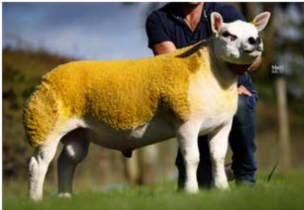
HAYMOUNT FAN DABI DOZI