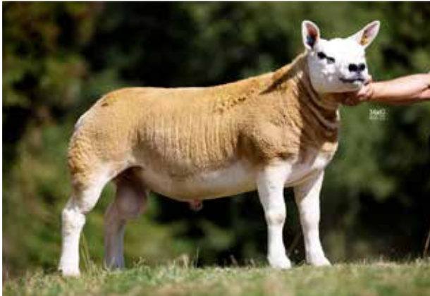
SPELLBOUND FAME & FORTUNE

Sold for the record priced lamb at 18,000gn English National Sale