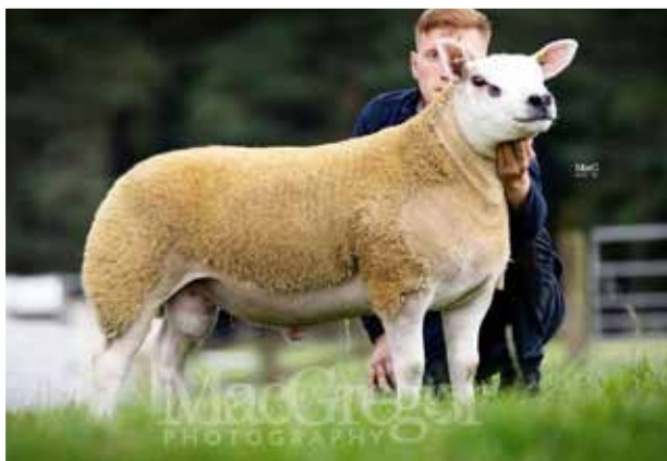
SPORTSMANS DEAL BREAKER

Dam: BGS1903804(E1) by PLASUCHA BIG GUN BFE1808110(E1)