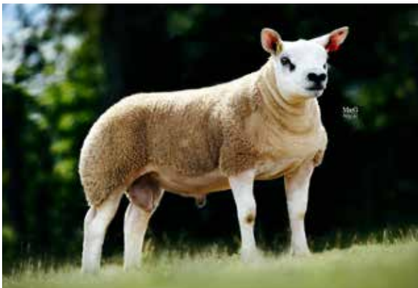
HEXEL FAN CLUB

Jointly purchased for 32,000gns, he has grown into a real machine, we are super excited to see his progeny.