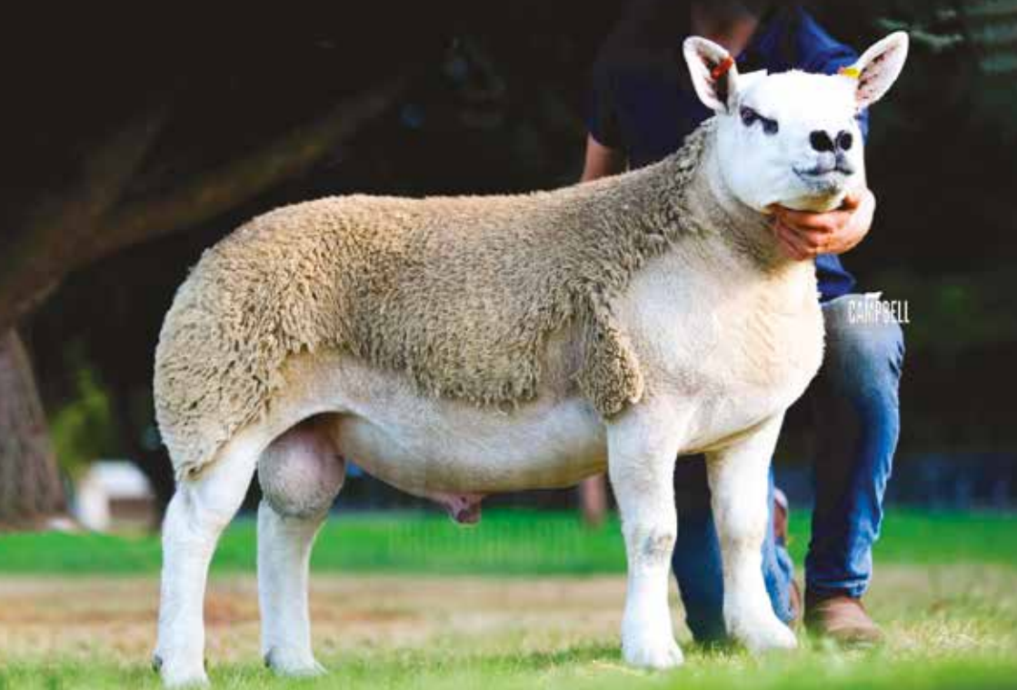
Milnbank Freddie, 25,000gns