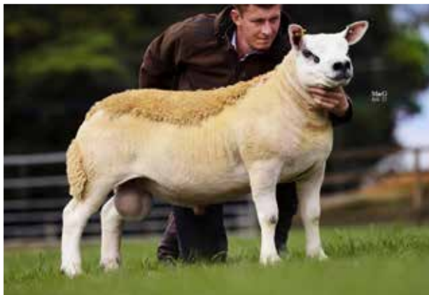
HADDO FEARLESS II