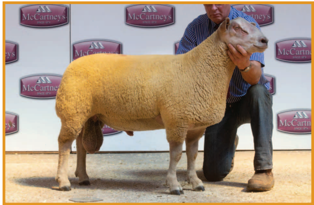
Son Edstaston Tempranilo 18TG00760 sold 2018 Premier Sale to E Buckley and J Jeffrey for 5,800 gns.

He has bred well for a large number of flocks producing many high priced sheep and several high profile show winners both in the U.K. and Mexico where a daughter out of Edstaston Oceania 14TG00340 won the supreme Champion Charollais female in 2021.