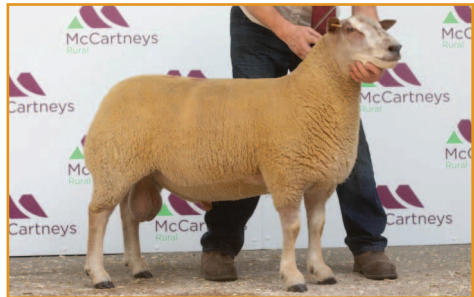
Edstaston U R The Man