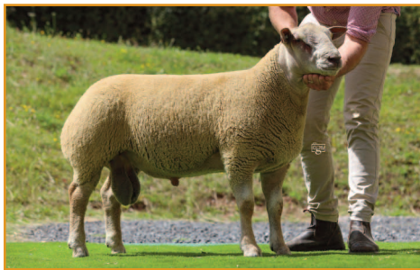
EDSTASTON BEST BAR ONE

Top 5% daughter out of Edstaston Wasabi 20TG00977 by the 4,000 gns. Dalby Ancelotti 22PE10661. Wasabi was out of the great show sheep Edstaston Samantha 17TG00622 whose granddam was the very influential ewe ZFY6073 purchased at the Rutland dispersal sale. A Samantha daughter 21TG01089 by Rockdale U2 H28-19-035 sold for £5,000 to the Boyo flock in 2022. Lot No. 7 23TG01318 is a full sister to the two top 1% Indexed rams Edstaston Best Bar One 23TG01316 and Edstaston Catch Me If You Can 24TG01449.