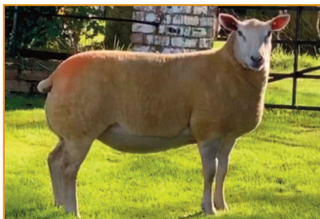
RIGGHEAD DAM OF LOT 14

Dam was purchased at Worcester Saucy Sale for 1,400 gns as a yearling after previously having been champion Charollais at the 2019 Dumfries show as a ewe lamb. Sire Tullyear Artemis has sold females to £3,000 twice for 24TG01436 and 24TG01456 to Fursdon and Boyo flocks respectively. A daughter in the sale is Lot No. 41