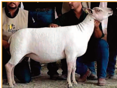
EDSTASTON OCEANIA DAUGHTER IN MEXICO

Edstaston Umpire Dickie Bird has bred very well in Canada and New Zealand. He was used very sparingly in the Edstaston flock due to his close breeding. Dam is Edstaston Oceania 14TG00340 the exceptional breeding ewe by Wernfawr Magnum 12XE00325 out of ZFY6073 purchased at the Rutland dispersal sale. Oceania was dam of the Supreme Female Charollais Champion at Mexico's National Show in 2021.