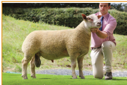
EDSTASTON BEAU JANGLES