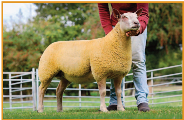
Daughter 25TG01510 sold to Graham Foster Oktoberfest 2025.