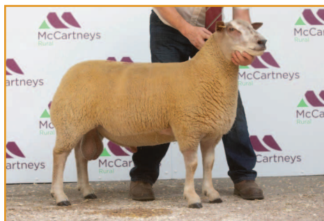
EDSTASTON U R THE MAN