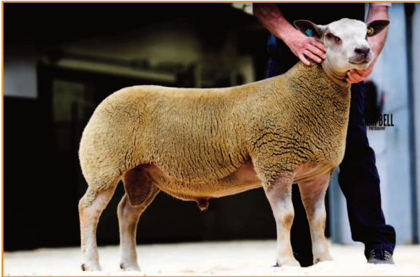
EDSTASTON CATCH ME IF YOU CAN

Top 1% indexed ram 433 who was sold at Carlisle Supreme Sale 2024 for 3,000 gns to the Dalby flock with a half share retained.