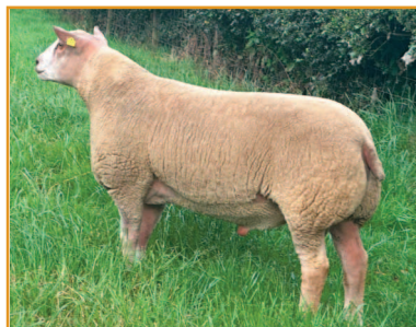
Edstaston Chip and Pin

Chip and Pin is out of Edstaston Tamsin by Tullyear Artemis. Full brother sold for 1,000 gns. to the Wraycastle flock at Carlisle Supreme Sale 2024 and two full sister sold for £3,000 to the Boyo and Fursdon flock.