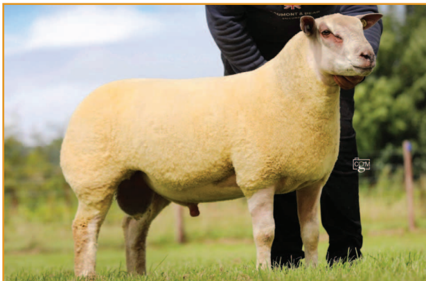
EDSTASTON BAD BOY