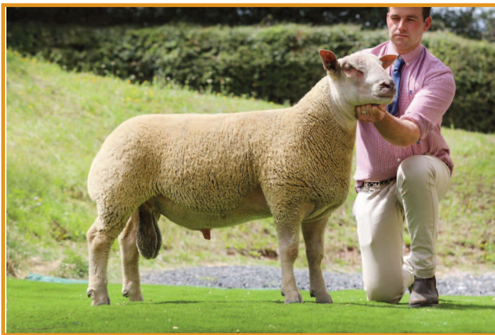
Edstaston Beau Jangles Premier Sale 2023