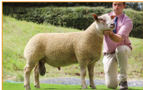
Edstaston Beau Jangles