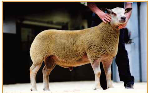
Edstaston Catch Me If You Can

Catch Me If You Can is jointly owned with Sercombe sheep and is the No. 2 Terminal Sire on Signet with an Index of 446. Semen has been sold worldwide to New Zealand, Mexico, Canada and Ireland.