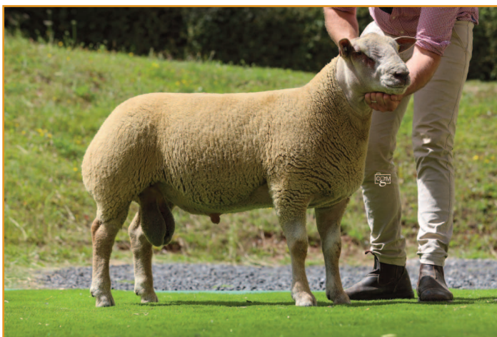
EDSTASTON BEST BAR ONE

See notes at the front of the catalogue for more information on the 4,000 gns. Dalby Ancelotti.