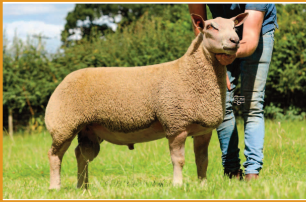
BOYO COMMANDER 24XHE01549 ARR/ARR

Purchased in conjunction with Sercombe Sheep for £12,000.