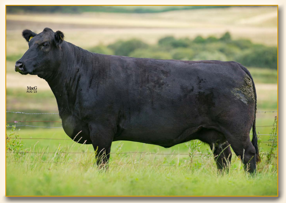
HW EBONY V756 (ET)