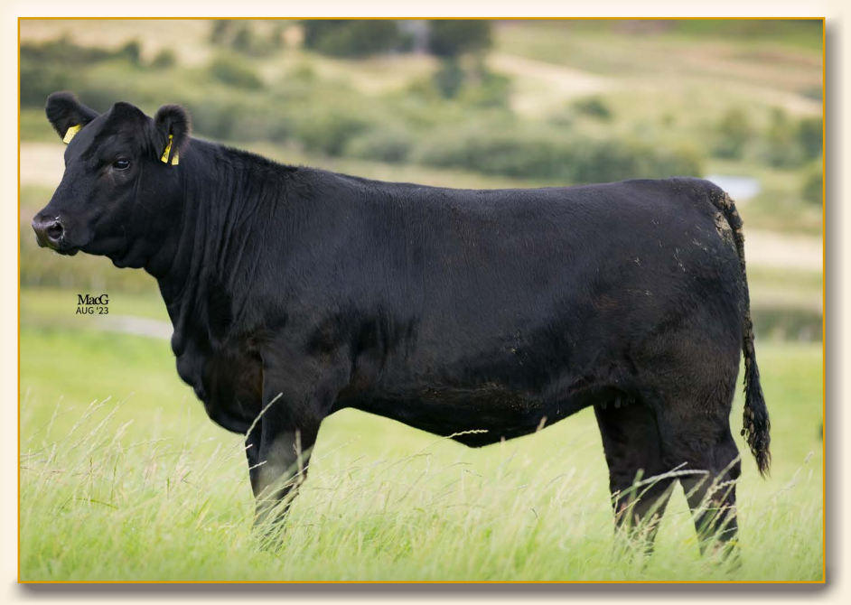
HW PROSPECT PRIDE Y723