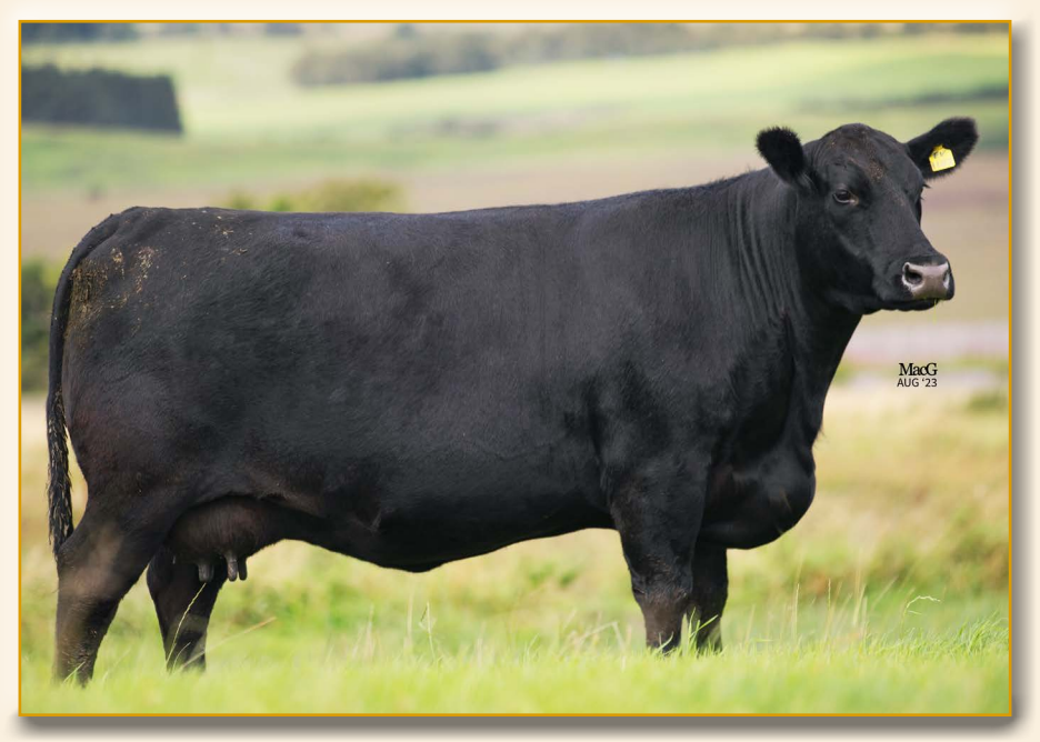
HW BLACKBIRD U473