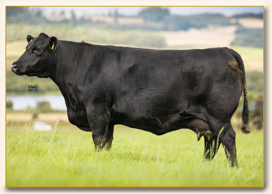
HW DUCHESS OF WINDSOR U479