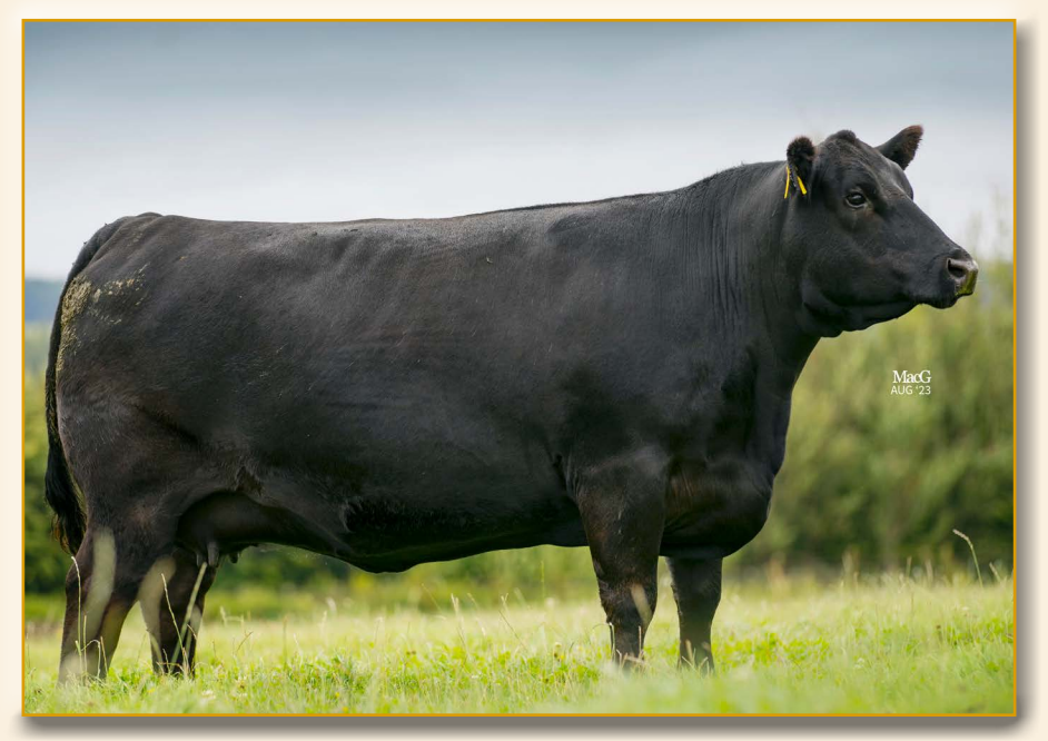
HW MADAME PRIDE V714 (ET)