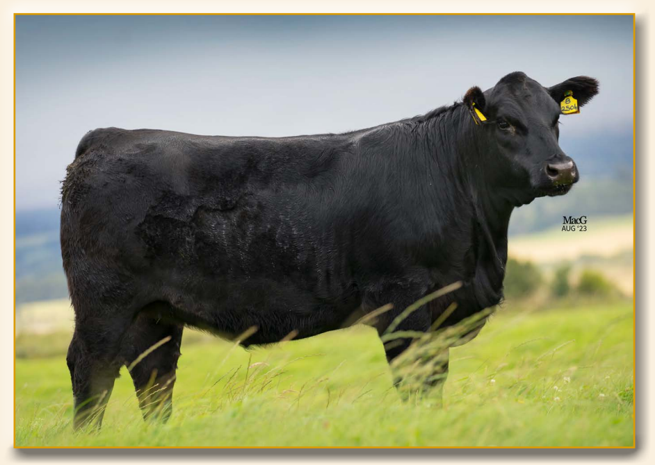
HW MISS ESSENCE Y695