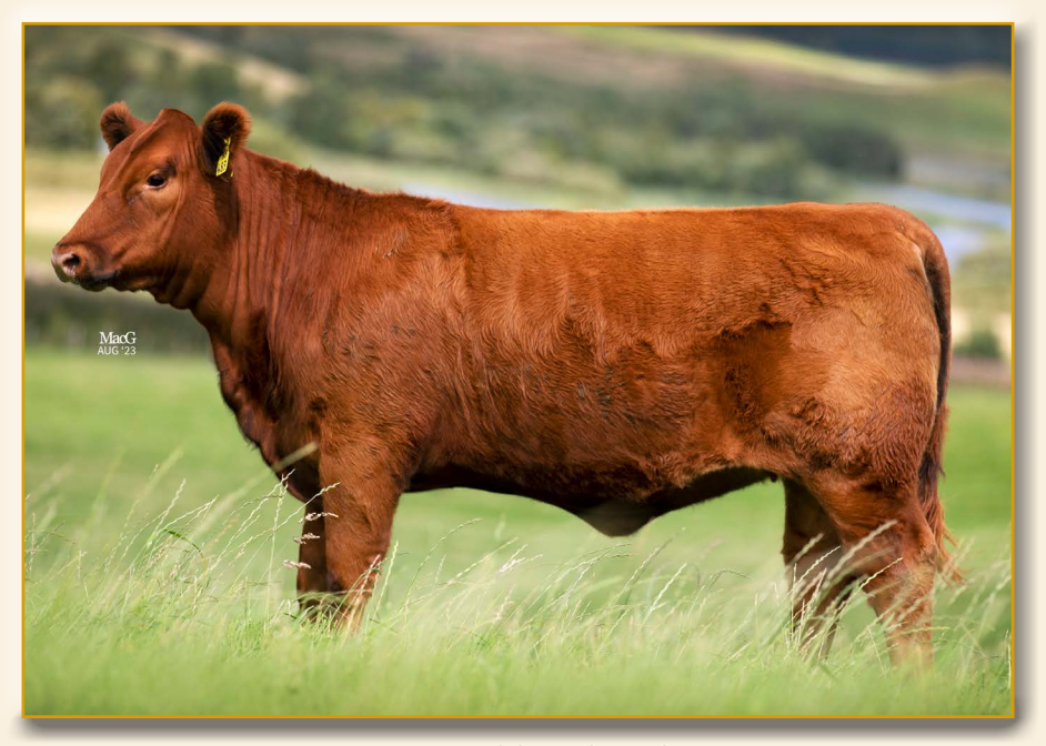
HW RED ESSENCE Y814