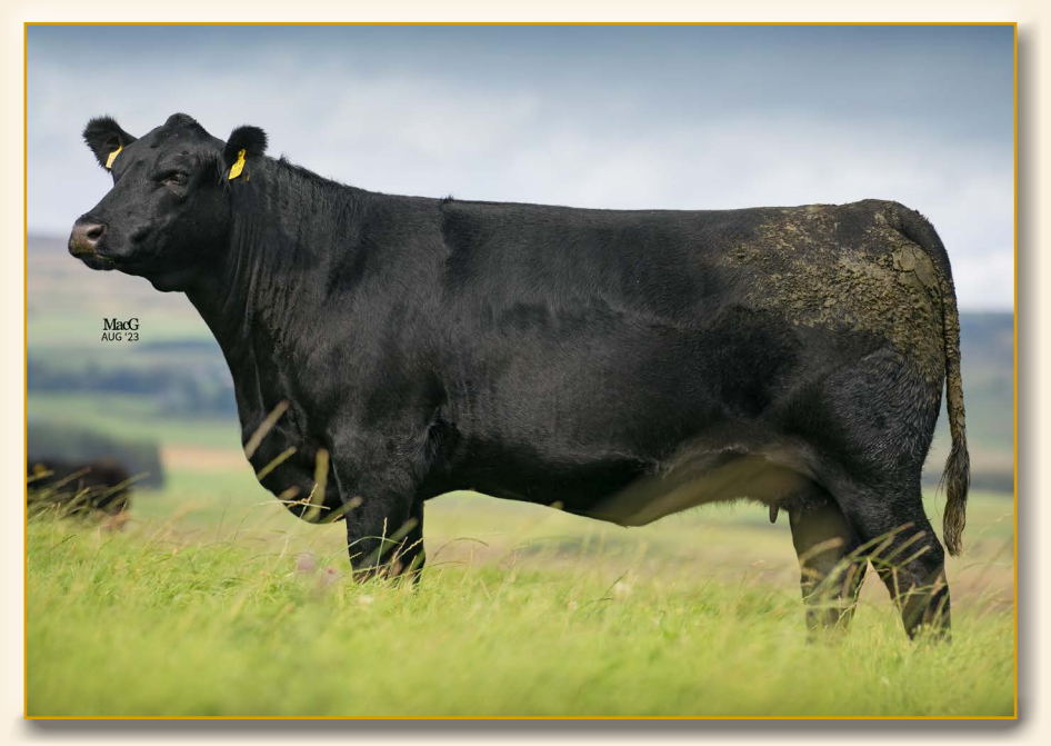
HW BLACKBIRD W144