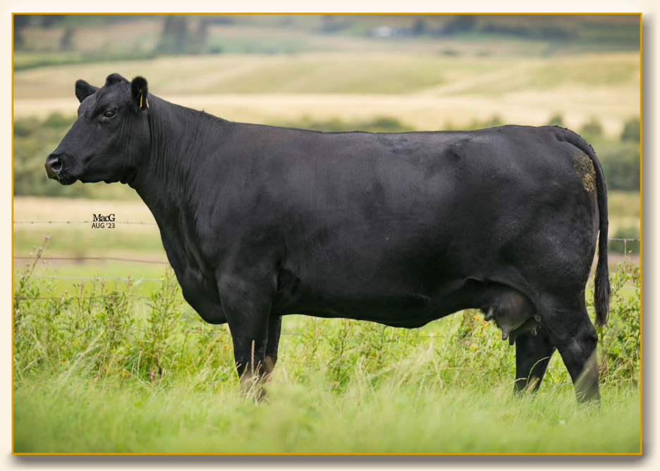
HW BLACK GOLD U452