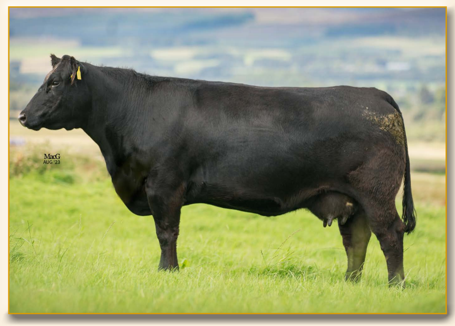
HW FRANCES V754