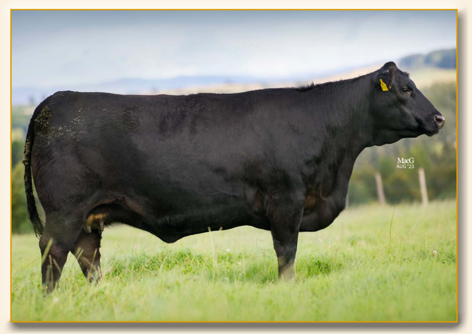
HW KAMARA W788