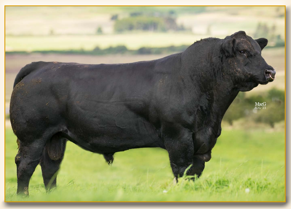
HW MR EQUILIBRIUM W202

A great chance here to get some calves of this exciting young sire whose first calves are born easy and grow quick with good muscle expression. Sired by one of Australia's highest ever performance sires and still appears in the pedigree many of the highest selling Angus still in Australia, His daughters at HW are some of our hardest working females we have and produce the goods every year that's why we are so excited about this young sire. Add in Netherton Miss Effie M726 one of our most consistent breeding donors ever bred at Netherton producing top sons sired by several sires to average over £5000 and daughters that are easy fleshed and maternal, she is sired by SAV Providence 6922 and out of Ankony Miss Eiffie 8433 both exceptional cattle and admired by cattlemen from all around the world.