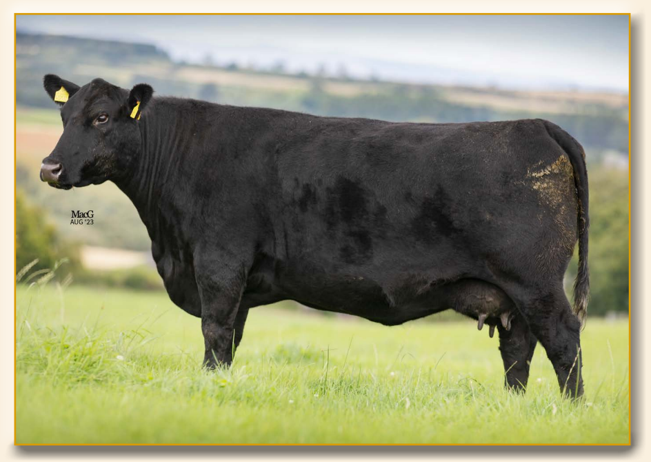
HW KARAMA V531