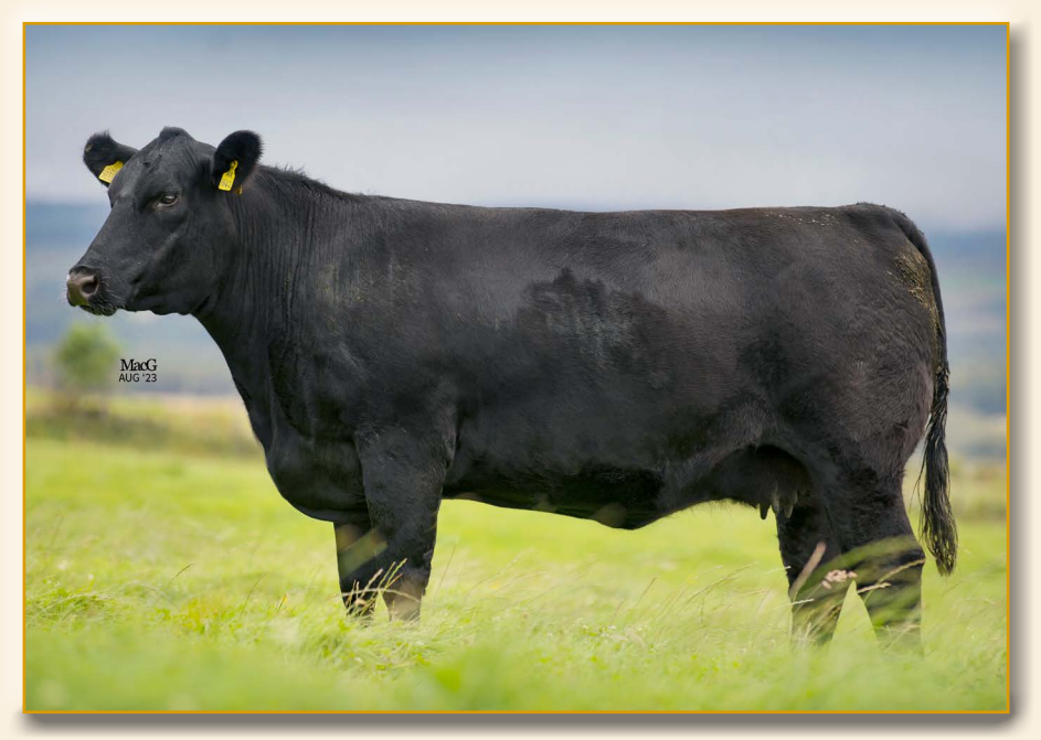
HW JEWOT ERICA W113