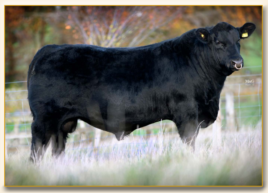
RAWBURN BANNOCKBURN T628

Bannockburn is designed for maximum feed efficiency without compromising on growth and breed character he really has suited our females with his first sons selling easily due to their performance, easy calving and phenotype, his first daughters have calved now and are just outstanding with perfect udders, milk and easy fleshing ability. His dam Nichols Bonnie has exceptional performance and is a leader for traits for feed utilisation and her 2015 born son shattered every record in the Nichols herd for Residual Average Daily Gain (feed efficacy and growth). His sire Quaker Hill Rampage is one of the most dominant sires ever in the US, A bull renowned for growth, structural soundness and fertility. Bannockburn will give you calves that will be born easy, grow quick with an unrivalled ability to turn grass or feeding into red meat. His figures are some of the best in the breed.