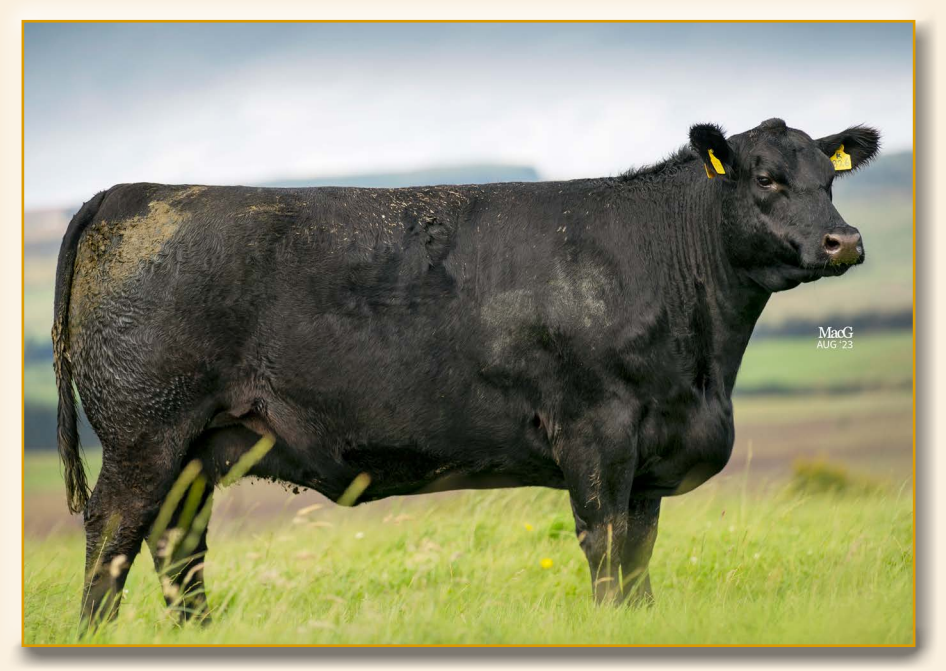
HW FLEUR V696