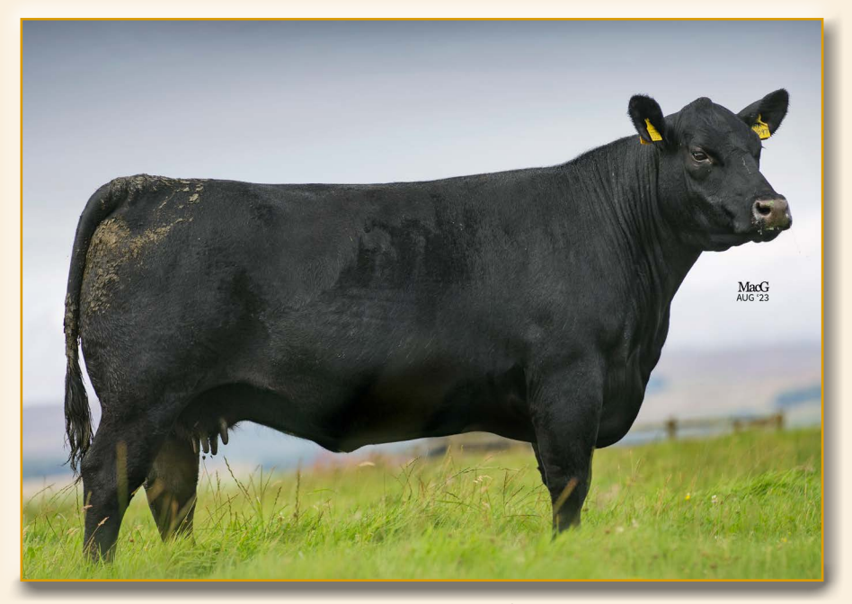
HW MAY W139