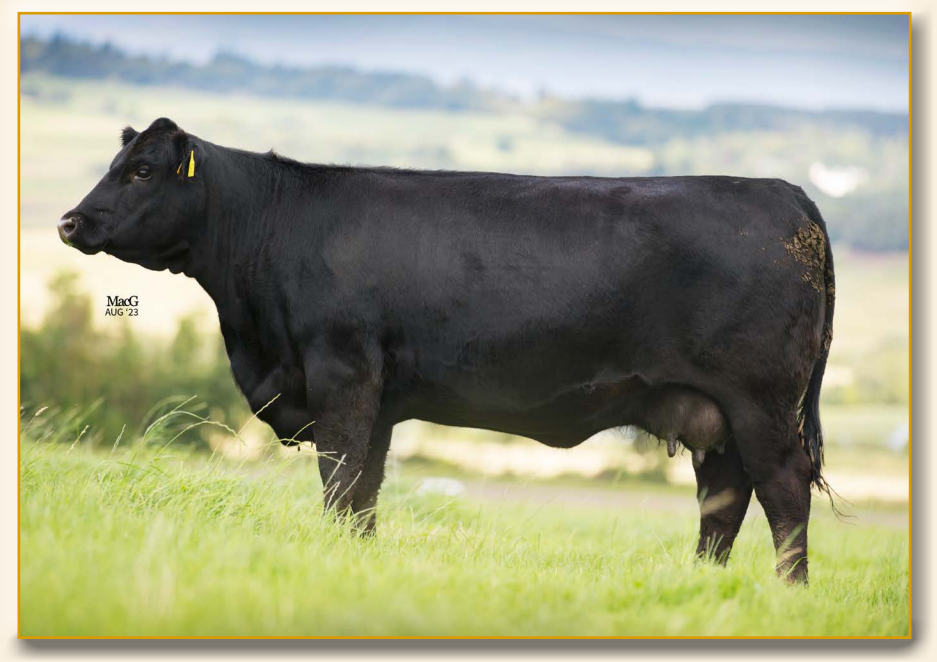
HW LADY HEATHER V546