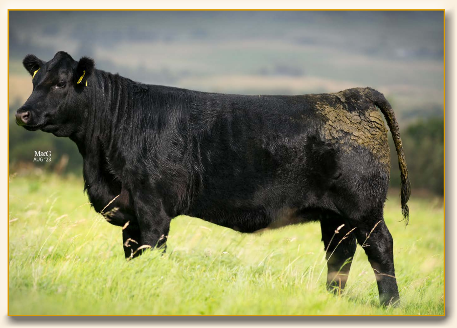
HW MISSIE Y647