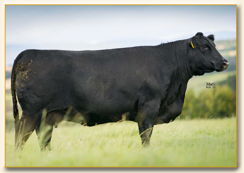
HW KAMARA W786