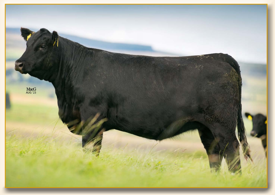
HW BLACK GOLD Y675