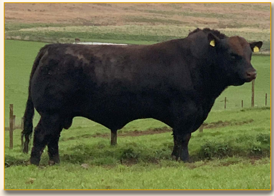
NETHERTON KRACKER P790

A sire who's sons in Ai studs HW Farghal and HW Lord Horatio are doing a great job. Kracker a son of our National Cow Champion in 2014 and sired by the cow maker SAV Brave. His maternal sister sold for 8000gns to Rawburn at last year's sale and in this year's sale you can see the strength of the Karama family in depth. We highly recommend his daughters in the sale for fleshing ability, good growth and milk.