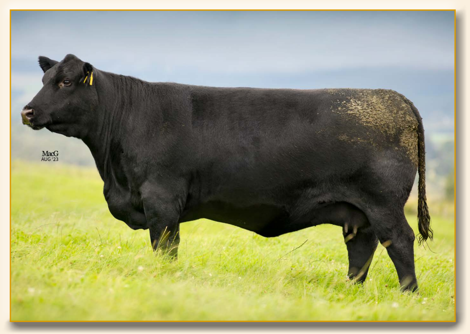
HW BLACK GOLD V740