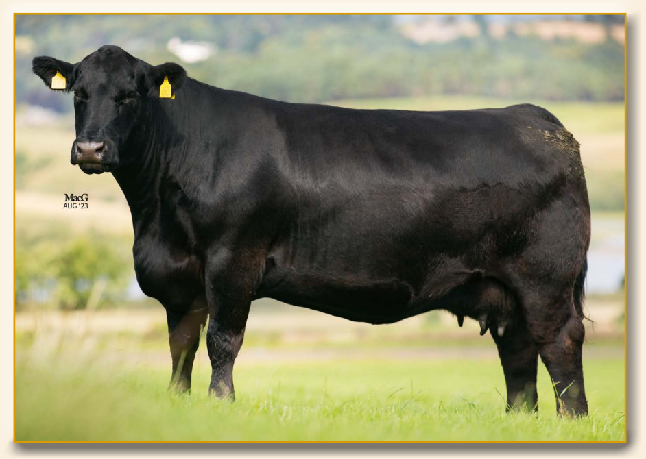
HW ERICA U474