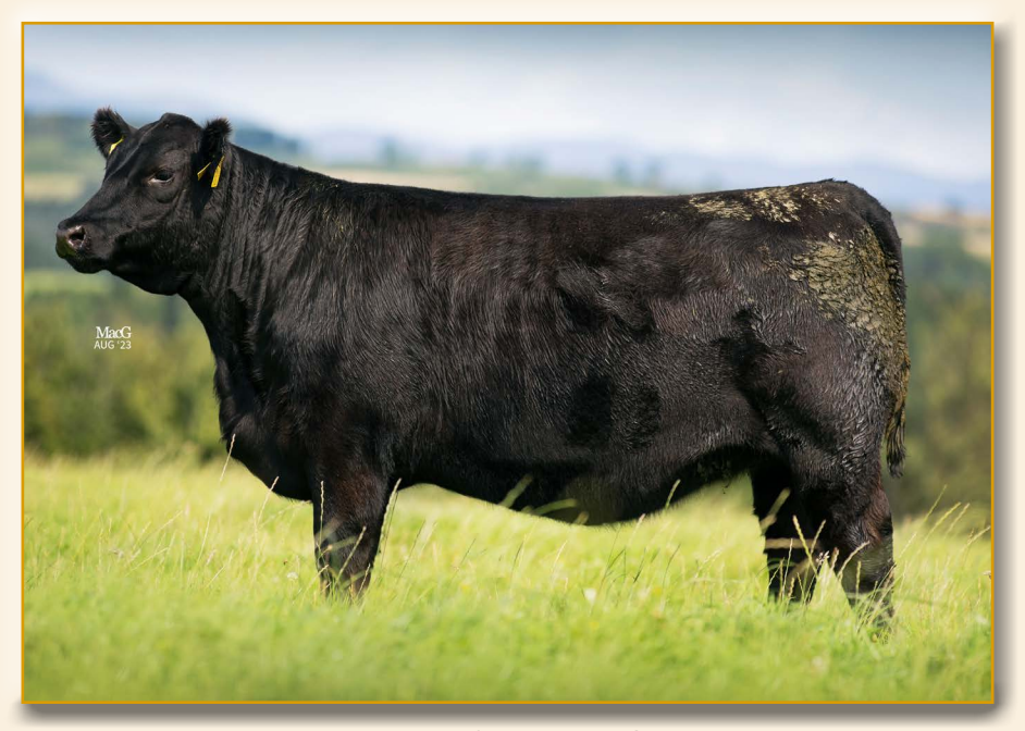
HW BLACKBIRD Y673