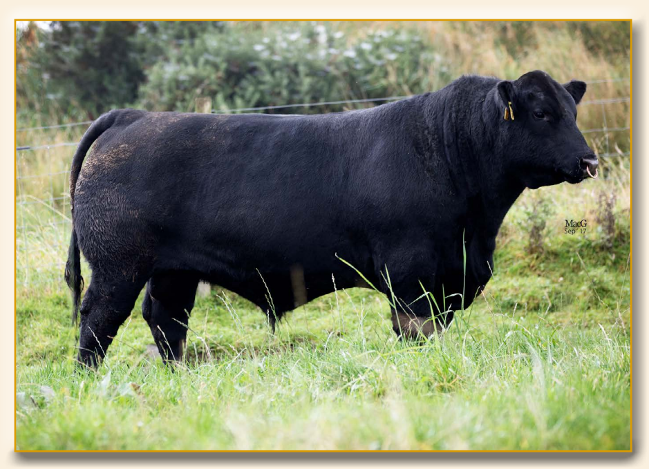
HW EVANDER S051

Worldwide semen available from HW ANGUS and GHYLL BECK GENETICS