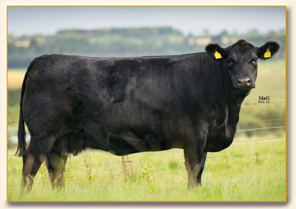
HW JEWANDA ERICA V667