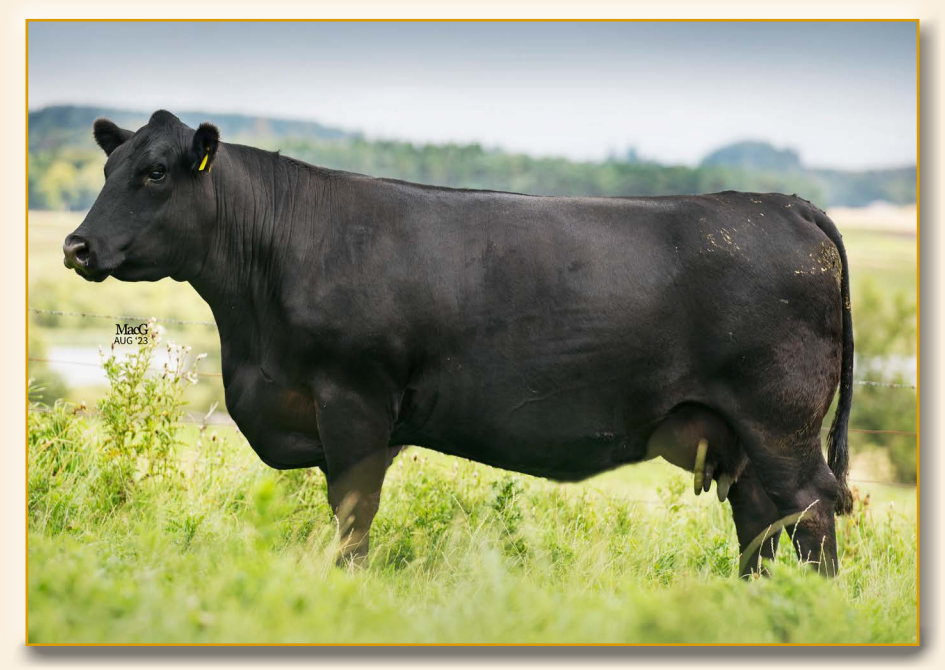
HW FLEUR V542