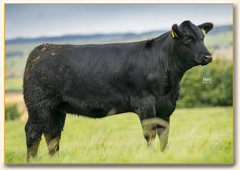
HW BLACKCAP MAY Y678