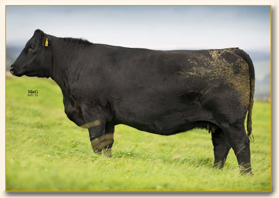
HW ANNIE X448