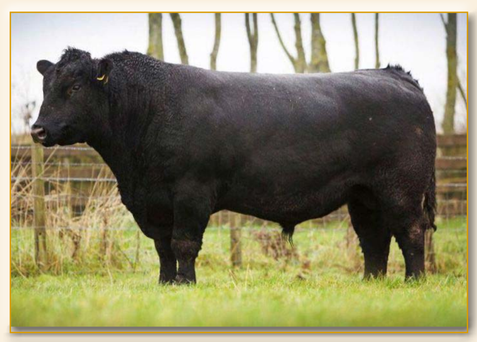
HW FABULOUS R565

A high growth bull with short gestation Fabulous has the who's who in his pedigree from the great F family at Netherton including Highland and Royal Show Champions multiply females that have sold for over £20,000, then add in the Beauty family who originate from Canada from one of Canada's Elite Performance cows it's no wonder his daughters are breeding so well. Then stack up the high performance bulls in his pedigree then you have something special here. His sons have sold to 9000gns for the Junior Champion at Stirling.