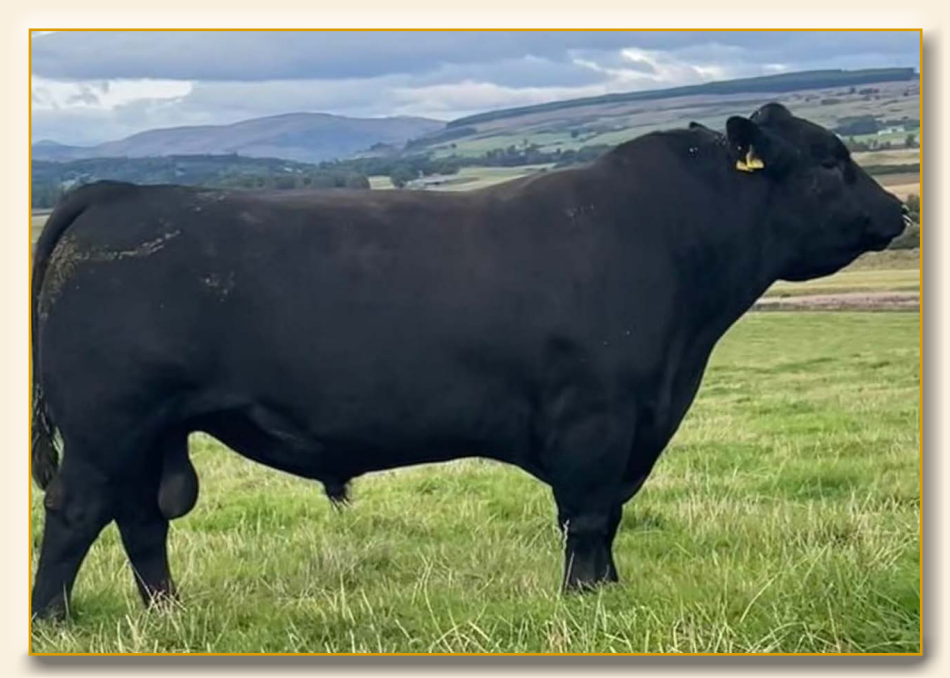
HW ABACUS V500

Our highest performance and stand out bull from our 2019 crop, Abacus has matured into a real eye catching bull and impresses all who see him for his fleshing and width of top. Sired by Rawburn Boss Hogg who has proven himself in many herds in Europe and out of our famous Annie family which include some of the highest [erformance sires from around the world Ardrossan Admiral, Vermillion Dateline, G13 Steel and TC Grid Topper add in the Annie, Beauty and Fleur families it's no wonder Abacus has worked so well for us being an easy calving and short gestation sire.