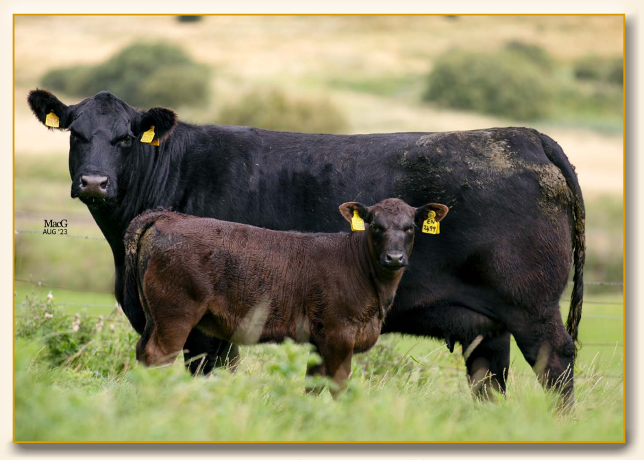
HW BLACKBIRD V499