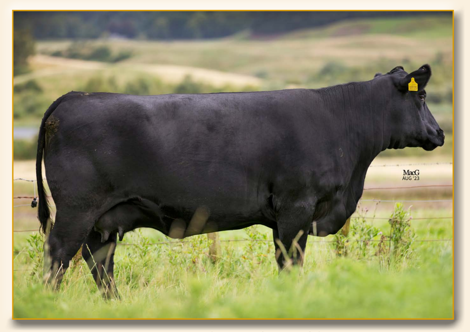
HW JEWOT ERICA W109