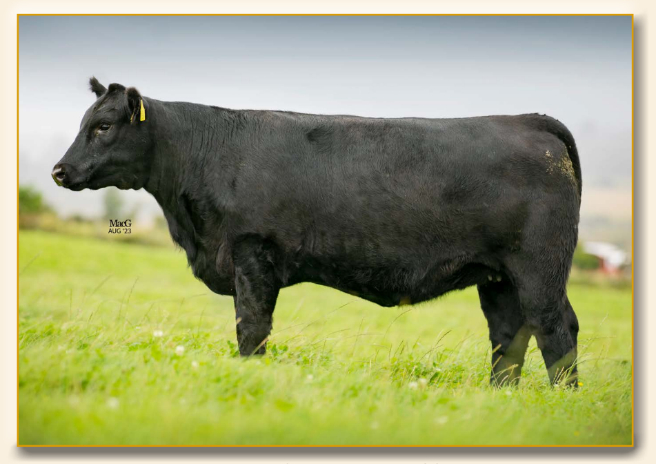
HW BLACK BEAUTY Y687