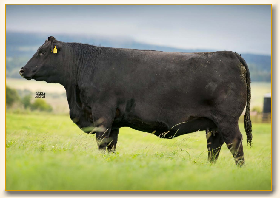
HW JEWLIOT ERICA W204