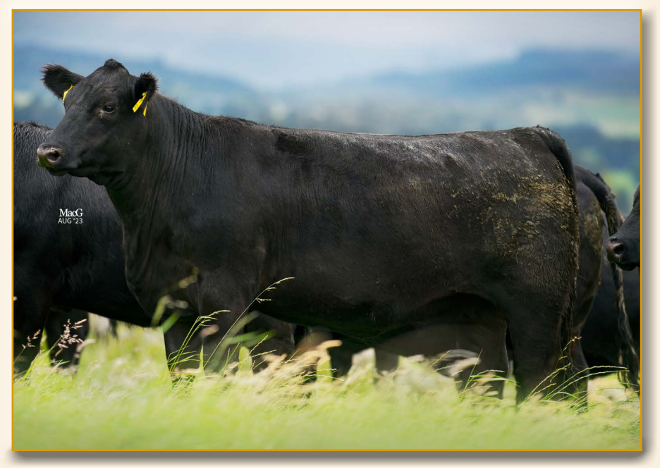
HW SHOZAN Y607