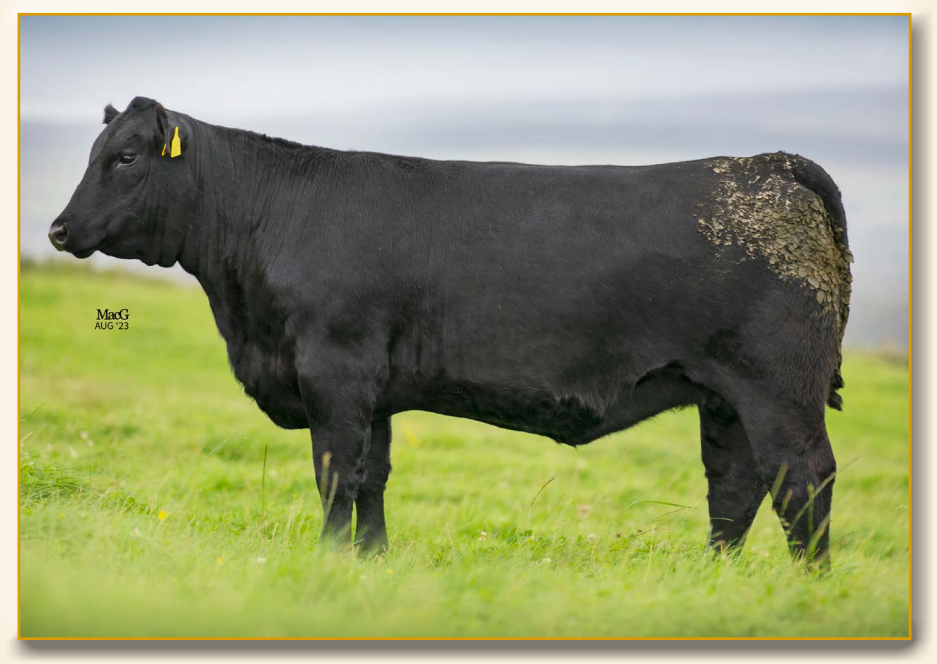
HW FRANCES Y681