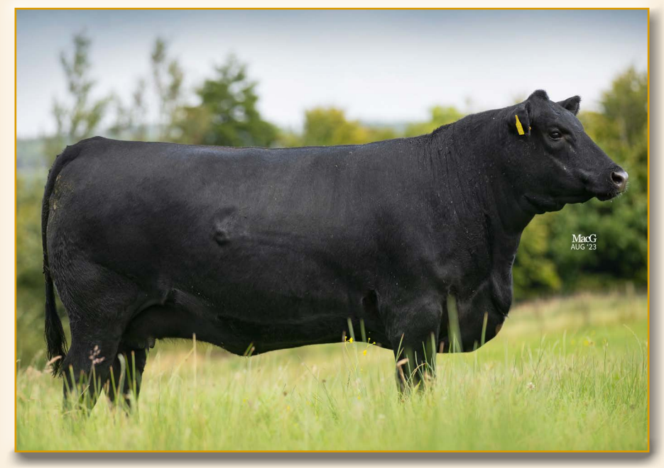
HW MISS EFFIE X411 (ET)