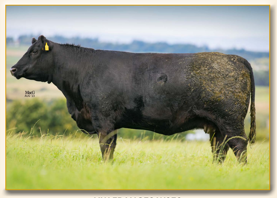
HW FRANCES W232