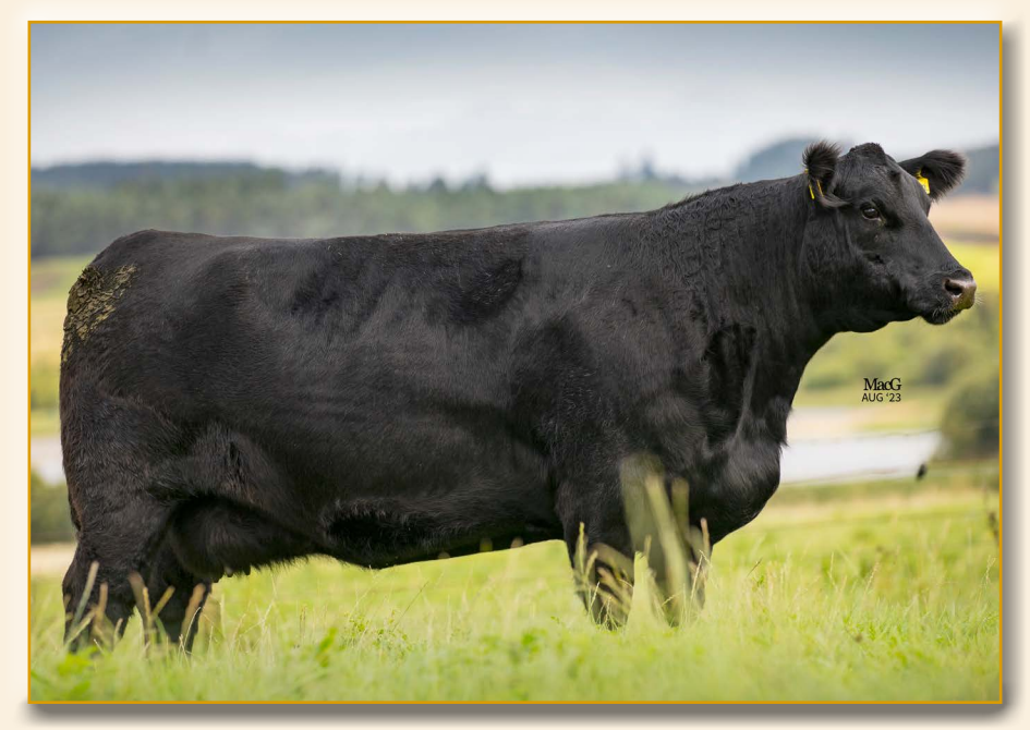
HW BLACKBIRD V672