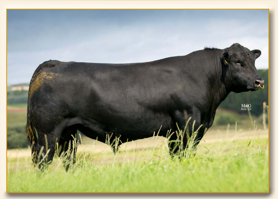
HW AUGUSTUS X462

From maybe one of the breeds top performance families who don't compromise on calving ease and birth weight in the chase for figures. Augustus is full brother to all our original Annie's and Netherton Archie who did so well not only for us and other breeders that 9 years after flushing Southland Awestruck one of the top TC Freedom daughters we've ever seen that we tracked her down in Texas to flush again to the original mating. His first calves from our 2 year olds are catching visitor's eyes for their character and fleshing ability.