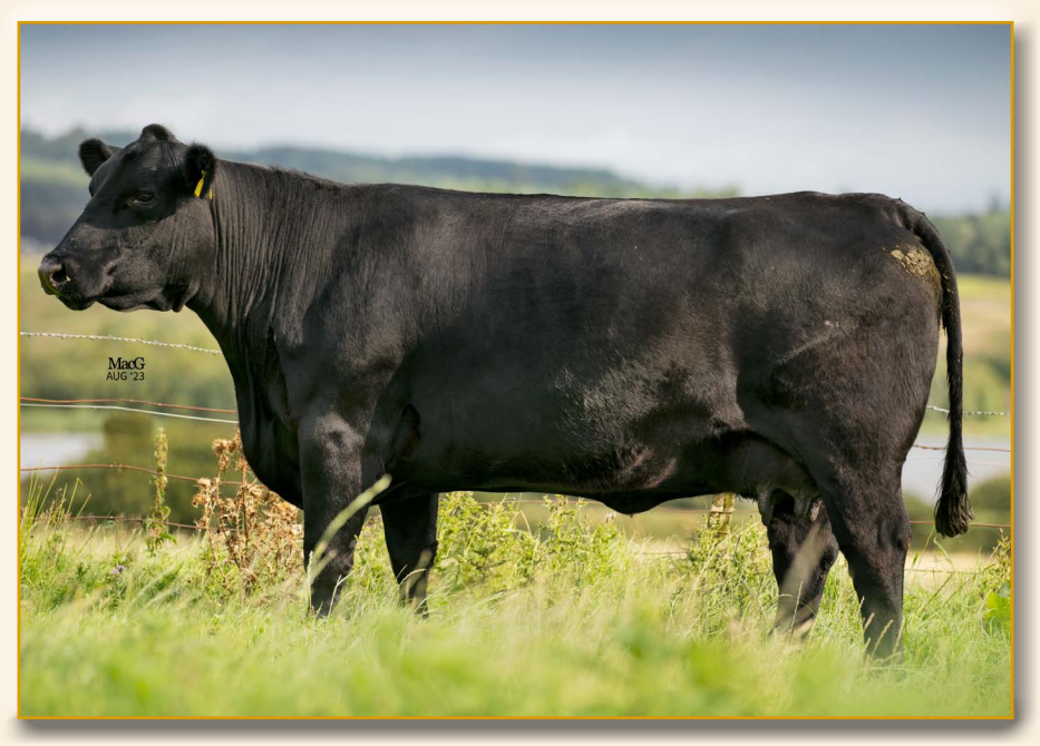
HW JEWOT ERICA V657