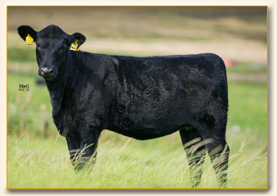
HW ANNIE Z826