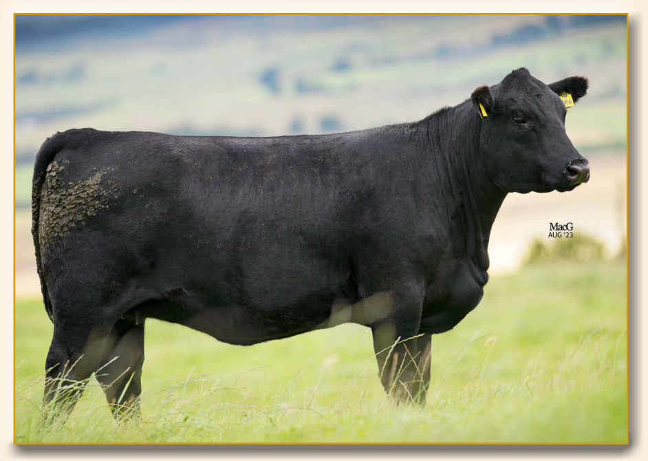
HW PRAULINE Y651