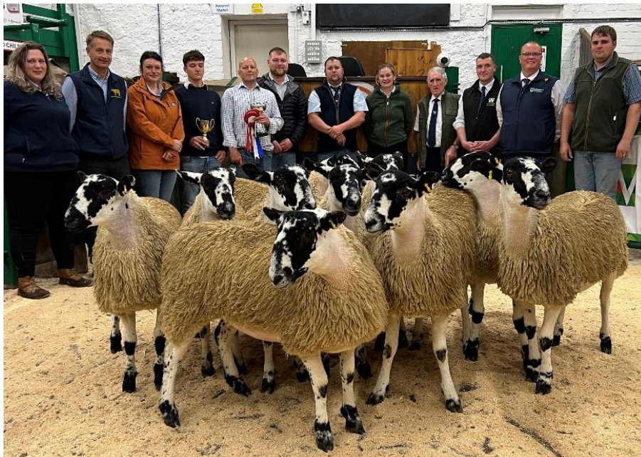
2022 Champion Pen from KA Brown & Sons, Asby Hall

for Members of the North of England Mule Sheep Association