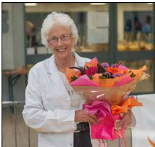
HONORARY MEMBER OF THE BERRICHON SHEEP SOCIETY 2021

Our females, with their depth of breeding have been the foundation of many new flocks and can be found throughout the bloodline in the UK, Ireland and Germany.