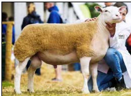
NEWARK WEST POINT

Won Male Champion RHS 2022, sired by Newark Vulture who sold to Ireland privately for £1000. Dam is out of Champion RHS 2021, she is still breeding in the flock. He was retained as a stock ram for this style, carcase, skin and correctness. His progeny has won 1st prize ewe lamb RHS and Dumfries show 2022 on her only outing.