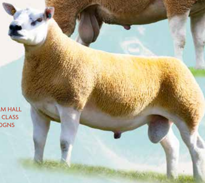
TATHAM HALL FIRST CLASS 6200GNS