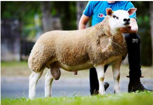
PENIEL FIRST CLASS

Overall Champion Ruthin Sale 2022. A joint purchase with flash, great colours, skin and conformation.