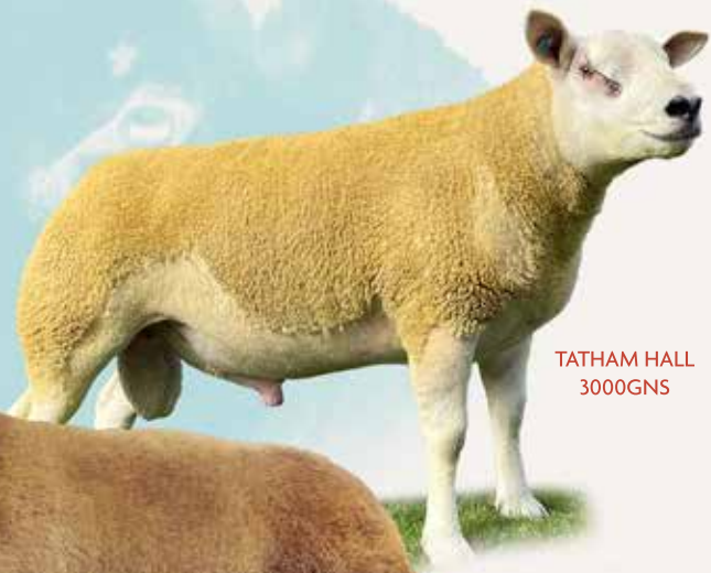
TATHAM HALL 3000GNS