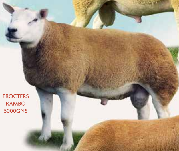
PROCTERS RAMBO 5000GNS