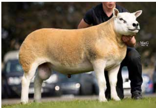
SCROGTONHEAD U STOATER

Purchased for £35,000. A great bodied ram.