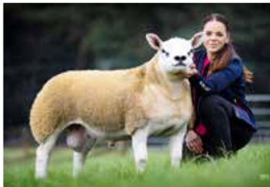
SPORTSMANS DOUBLE DIAMOND

Purchased jointly Lanark 2020 for 350,000gns. He has bred sons to 100,000gns, 80,000gns, 52,000gns and 24,000gns. The Proctors pen of ram lambs at Lanark 2021 sired by Double Diamond averaged £22,905.