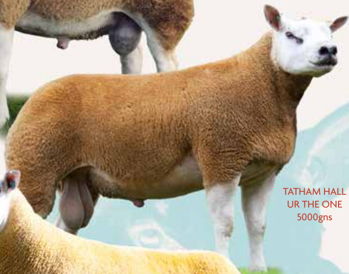
TATHAM HALL UR THE ONE 5000gns