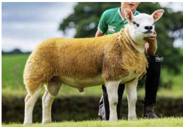
PROCTERS EL JEFFE

Lots 13 and 14 are full sisters to £11,000 Procters El Jeffe.