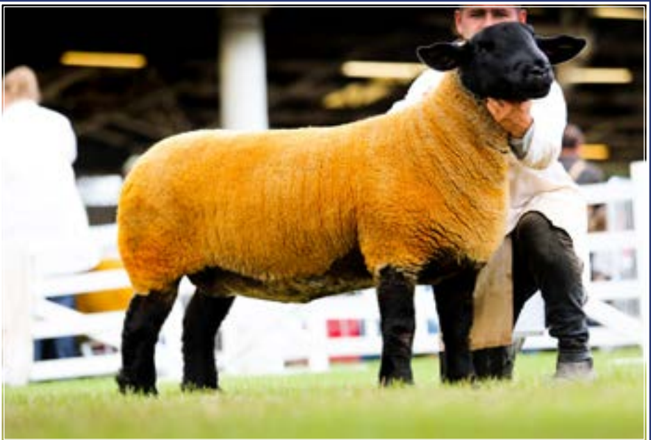
GREAT YORKSHIRE SHOW CHAMPION 2023