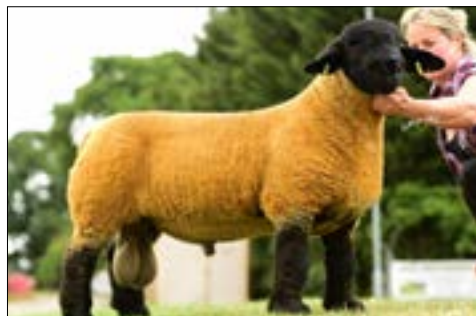
ROOKERY MEAN MACHINE

Purchased at Shrewsbury 2022. Bred very well in his first year, with a son being one of the service sires at Burnviews dispersal sale.