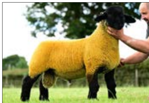
BALLNACANNON FLASH MAN

gs: Salopian Scuderia (V87:19:00614) gd: Lakeview (JFF:17:02679) gs: Birness Muzza (1W:19:02405) gd: Ballynacannon (KKW:16:00736)