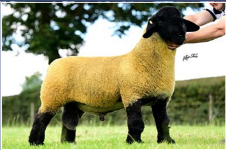
LAKEVIEW 52,000gns Lanark top price suffolk 2023