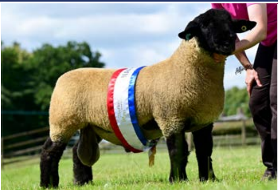
LANARK CHAMPION 2023