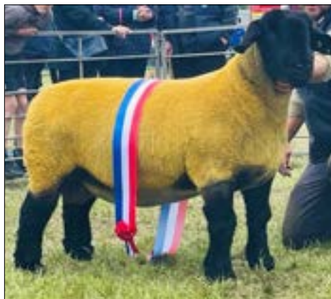
DAM OF PHOENIX

Purchased for 7,000gns along with Claycrop, Limestone and Topgun flocks. Bred very well in first season with sons to 11,000gns