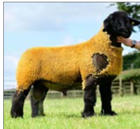
CASTLEISLE BLACK ADDER