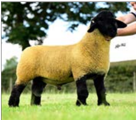
LAKEVIEW 1 UP

Lakeview 1 Up was purchased for 52,000gn with the Sportsman's flock at Lanark.