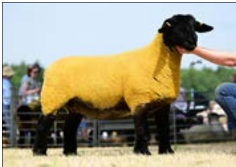
ET SISTER TO LOT 425

426 LIMESTONE KPC:22:02011 (UK1790724/02011) SINGLE-ET 10/02/2022 ARR/ARR