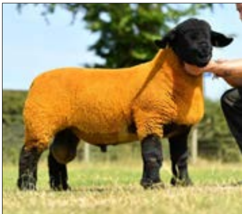
8000GN SALOPIAN ZOOLANDER (SIRE OF THE TWO MIDDLEMUIR GIMMERS) SIRE OF LAMBS TO 1000GNS

16 Jan 2021 gs: Crewelands Kingpin (PWN:18:01027) gd: Strathisla (FNV:13:144) gs: Muirton One Direction (K14:00892) gd: Salopian (V87:15:00233)