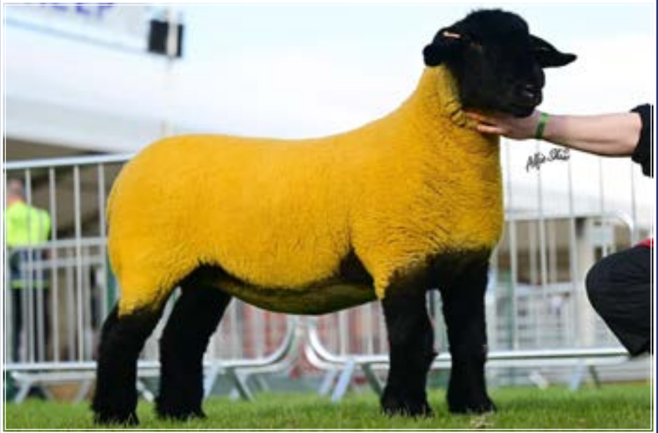
BALMORAL SHOW CHAMPION 2023