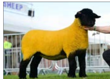
ET SISTER TO LOT 424