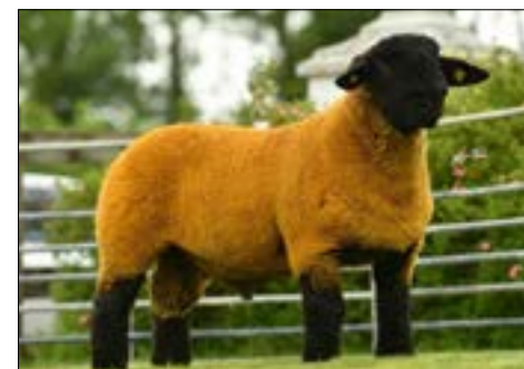
CASTLEISLE A KINGSMAN

This lad has bred exceptionally well with his ram lambs topping at £16000gns with multiple sons making four figures upwards. An Absolute Powerhouse!