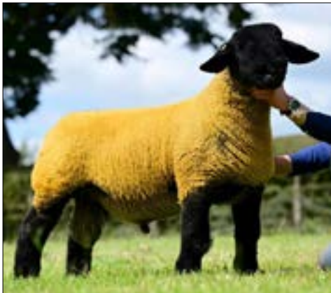
BALLYNACANNON IRON MIKE

Purchased for 8,000 along with Limestone, Castleisle and Oakbridge. Purchased for his great power and head. These are the first females offered in lamb to him