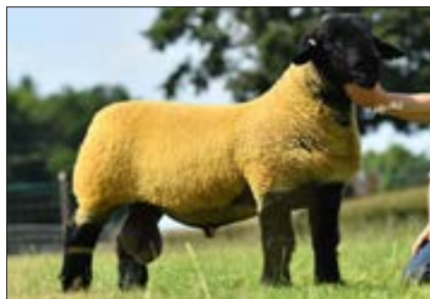
STRATHBOGIE NEVER SAY NEVER

gs: Crewelands Kingpin (PWN:18:01027) gd: Strathisla (FNV:13:144) gs: Castleisle Knockout (DDX:15:00933) gd: Deveronside NAJ:11:024)